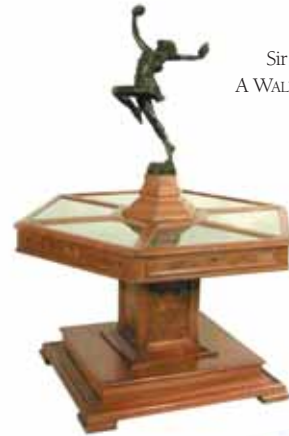
Sir Robert Lorimer A WALNUT HEXAGONAL DISPLAY TABLE Sold £22,350