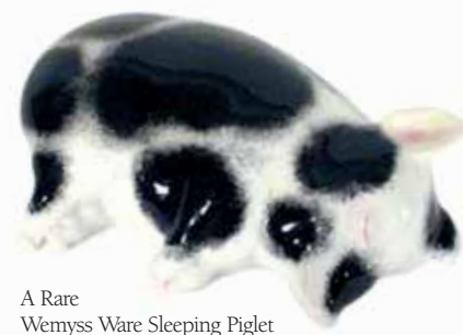
A Rare Wemyss Ware Sleeping Piglet Sold £14,700