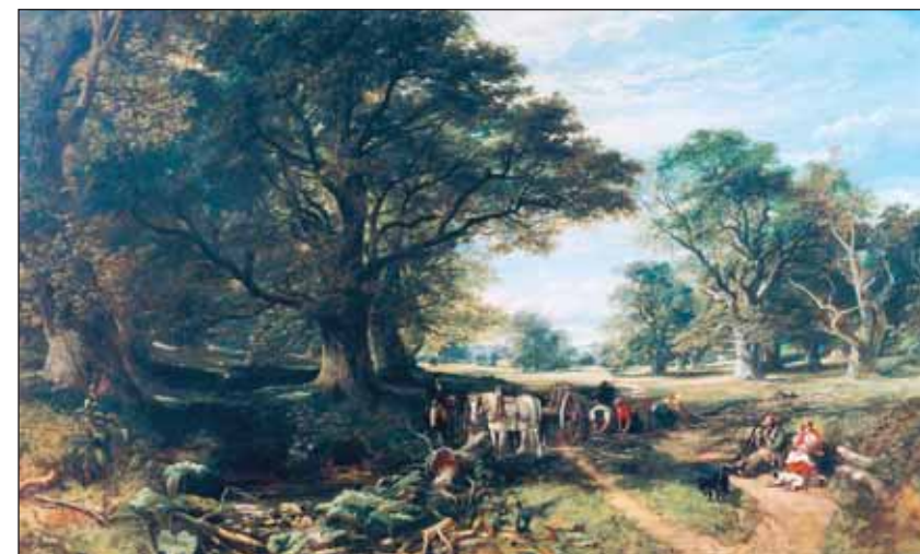
Sam Bough ARSA, RSA, RSW, CADZOW FOREST, Oil on Canvas Sold £70,575