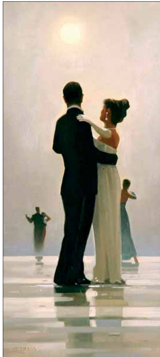
Jack Vettriano OBE, Dance Me to the End of Love, Oil on Canvas Sold £346,000

Much of our time is spent visiting clients at home or discussing items at the auction room. Even if you aren't sure of an item's value, we always prefer to take a look. There is no obligation to sell, should you change your mind. Our combined knowledge of the market adds up to some hundred years of experience. We want you to take advantage of our expertise.